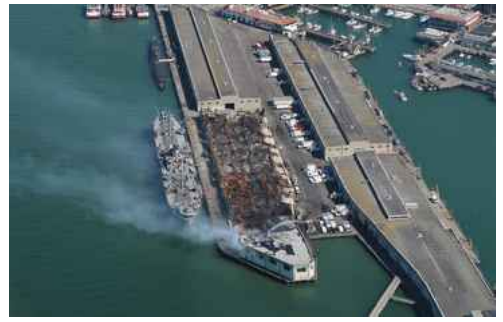
Pier 45, San Francisco, May 2020. USS Pampanito and SS Jeremiah O'Brien.

The O'Brien used to be at Pier 45, but the fire in the shed a few years back forced a move to a better location at Pier 35. When you do visit, be sure to check out the galley – The stove/oven uses good old-fashioned coal, but the pressure cooker runs on steam from the boilers. And the ship still cruises under its own power – with a full load of about 800 passengers for an experience you won't forget.